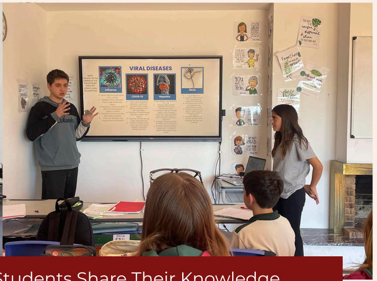
Peer Teaching in Action: Year 9 Students Share Their Knowledge.