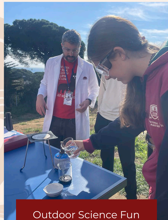
Outdoor Science Fun with Year 9