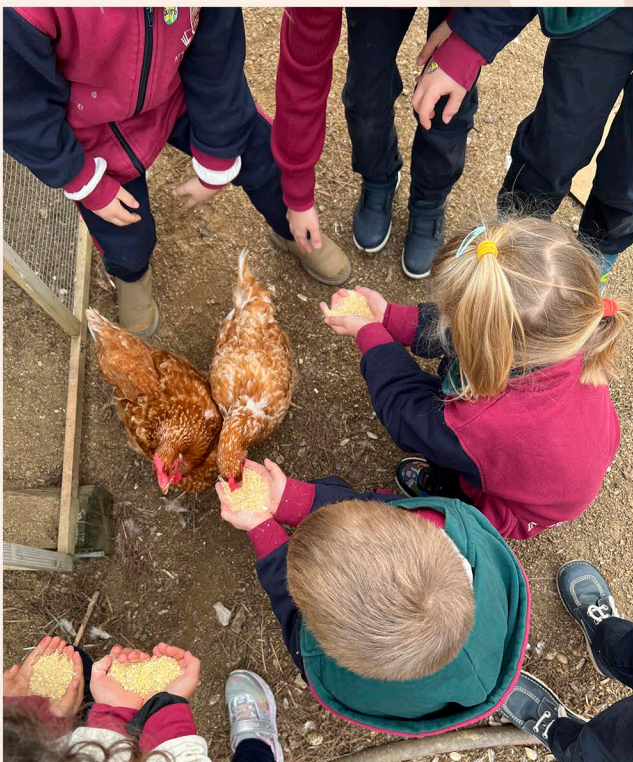
Feeding the chickens!