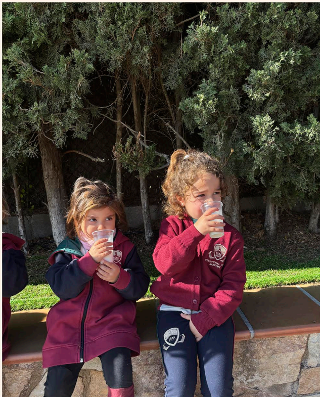
Drinking milk during the break!