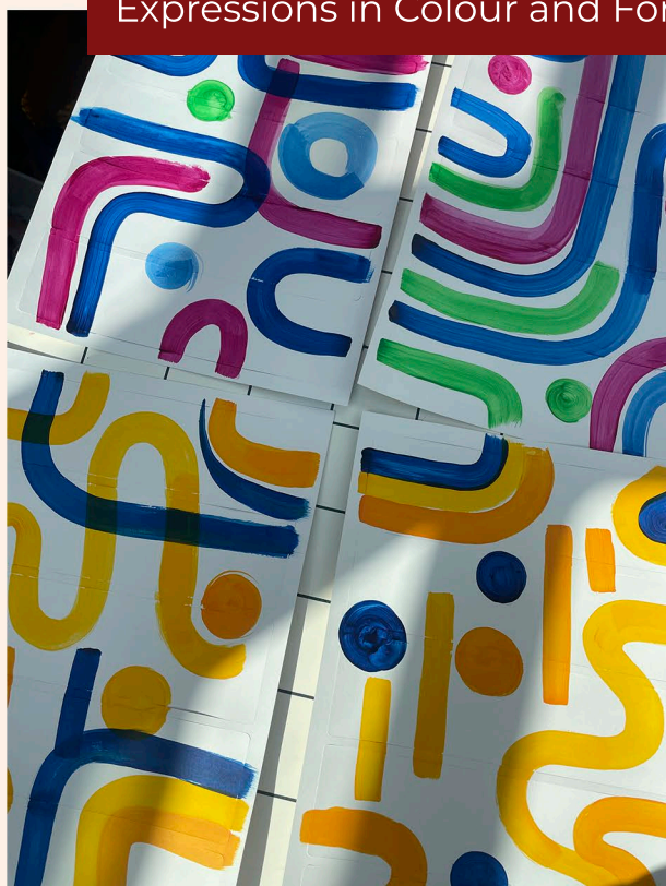
Expressions in Colour and Form: Art by Our Secondary Students