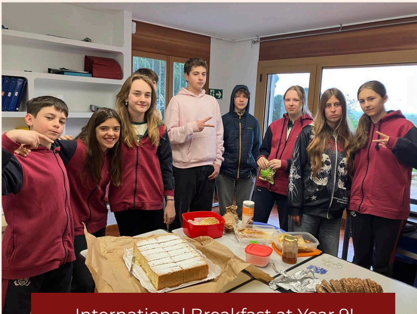
International Breakfast at Year 9!