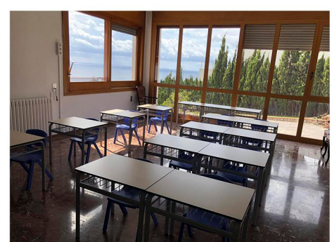
Year 1 Classroom